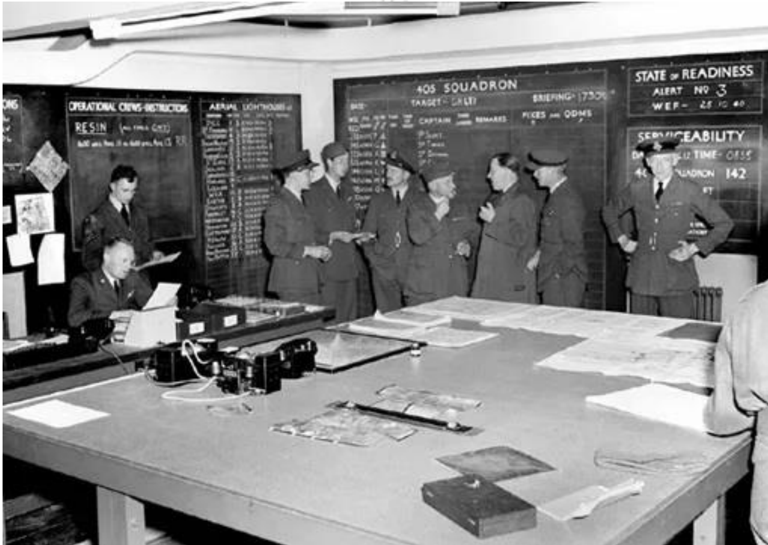
Caption: The Operations Room of RCAF No 405 Squadron, in 1941.